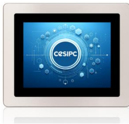
G-Series 10inch IP69K Panel

G-Series offers multiple screen sizes for various hygiene-grade applications