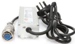
Power adapter: Waterproof power adapter