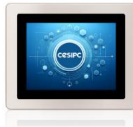
G-Series 15inch IP69K Panel