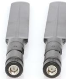
Antenna: SMA antenna