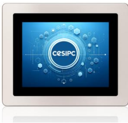
G-Series 10inch IP69K Panel

G-Series offers multiple screen sizes for various hygiene-grade applications