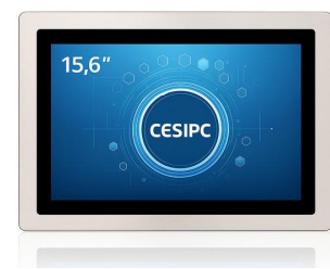
G-Series 15.6inch IP69K Panel