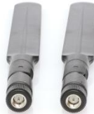
Antenna: SMA antenna