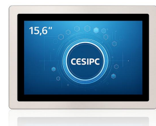
G-Series 15.6inch IP69K Panel