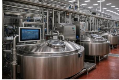
Dairy & Beverage Production Line