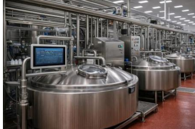
Dairy & Beverage Production Line