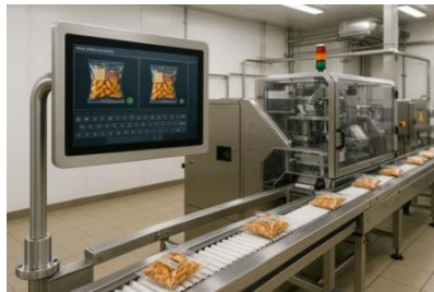
Packaging & Vision Inspection