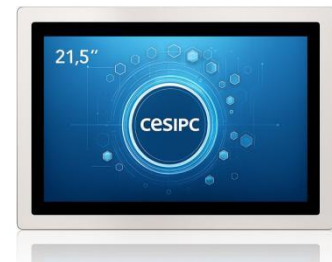
G-Series 15.6inch IP69K Panel