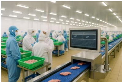
Slaughtering & Fresh Processing