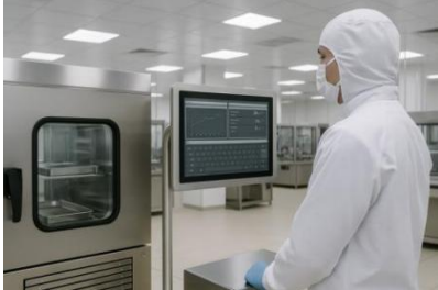
Cleanroom & Test Chamber

Ideal for hygienic processing, food & beverage, pharmaceutical cleanrooms, and washdown environments.