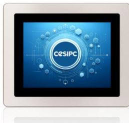
G-Series 10inch IP69K Panel

G-Series offers multiple screen sizes for various hygiene-grade applications