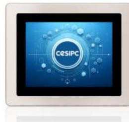
G-Series 15inch IP69K Panel