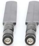
Antenna: SMA antenna