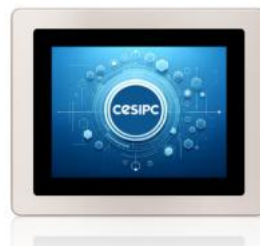
G-Series 15inch IP69K Panel