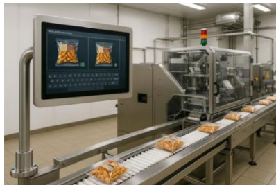
Packaging & Vision Inspection