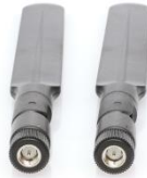
Antenna: SMA antenna