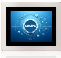
G-Series 10inch IP69K Panel

G-Series offers multiple screen sizes for various hygiene-grade applications