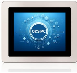
G-Series 10inch IP69K Panel

G-Series offers multiple screen sizes for various hygiene-grade applications