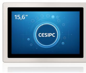
G-Series 15.6inch IP69K Panel