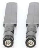
Antenna: SMA antenna