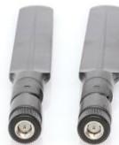
Antenna: SMA antenna