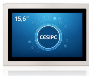
G-Series 15.6inch IP69K Panel